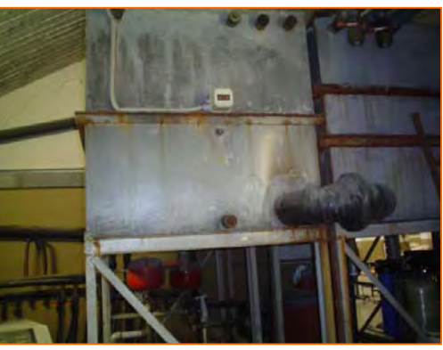
Insulation of cold water tank in order to stop 6 °C losses in heat and therefore save energy