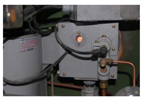
Usage of One Burner