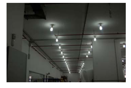
Power Savings Bulbs