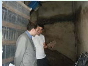
At Olive Trade