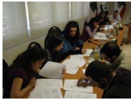
photos during the Workshop